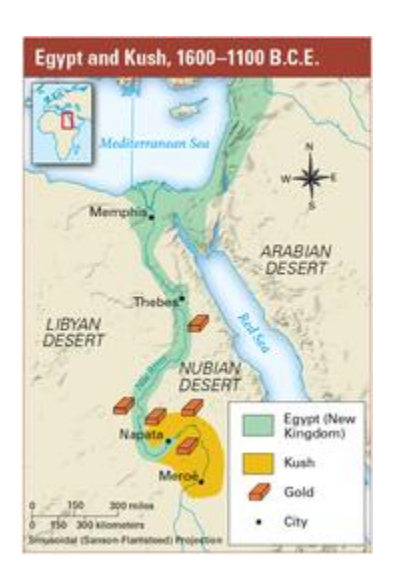
Section 2 - The Egyptianization of Kush

Aside from Egypt, Kush was the greatest ancient civilization in Africa. Like its neighbor to the north, Kush grew up around the fertile banks of the Nile River. Kush was known for its rich gold mines. In fact, another name for Kush is Nubia , which comes from nub , the Egyptian word for gold.